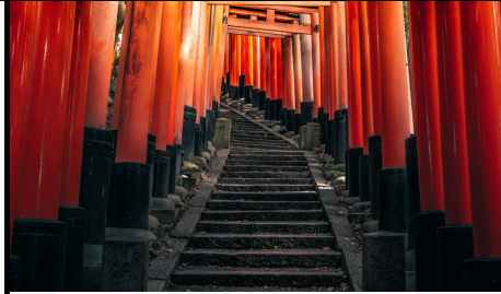
Tokyo & Kyoto